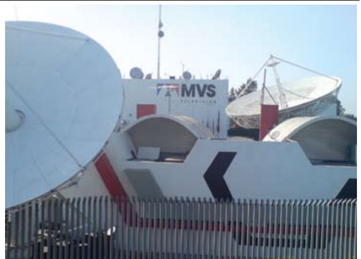
Headquarters of MVS Multivision in Mexico City

Multivision serves markets that are often separated by hundreds or thousands of kilometers in places like