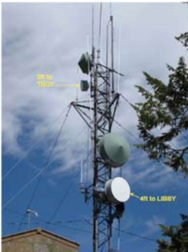
Repeater tower at King Mountain

When Time Warner needed to increase data transmission speed between its headends at Libby and Troy, Montana, Cable AML came up with the perfect solution.