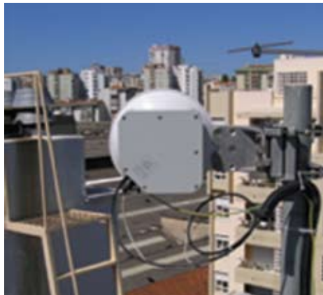
A single remote transceiver on a rooftop provides wireless triple play service to all units of a large MDU.

The commercial success of this system, even in a high infrastructure and competitive country such as Portugal, has prompted plans for expansion to other countries, currently in process.