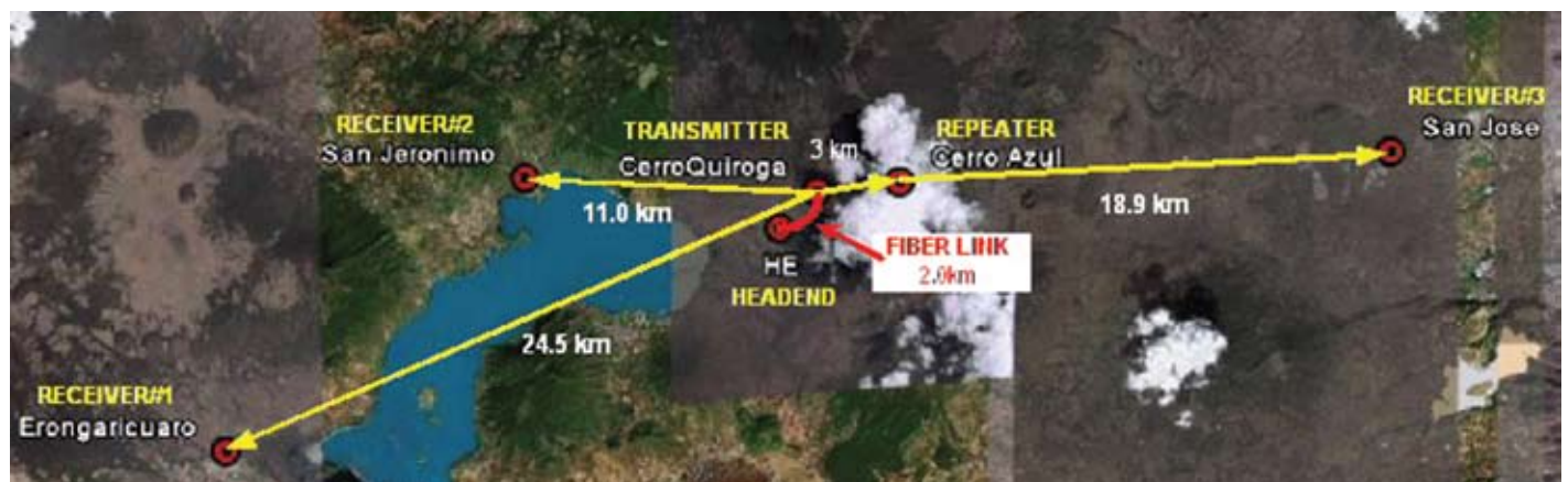
Microwave distribution network: transmitter at Cerro Quiroga powers three receivers at 11, 24.5 and 18.9 Kms (one of them through a repeater).