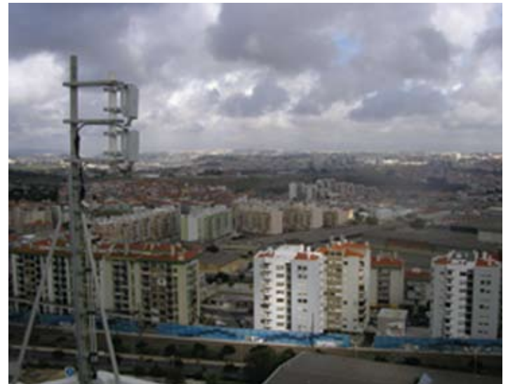
Base Station Transceiver Antennas installed on a rooftop in Lisbon, Portugal.

The system, designed by Cable AML, is the largest wireless triple-play (digital TV, voice and data) system in the world. Operating in the 28 GHz frequency band, it features state of the art equipment transmitting over 40 digital video channels and providing broadband In-