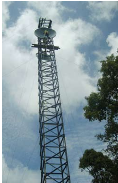
Installation technician adjusts one of the two repeater antennas.